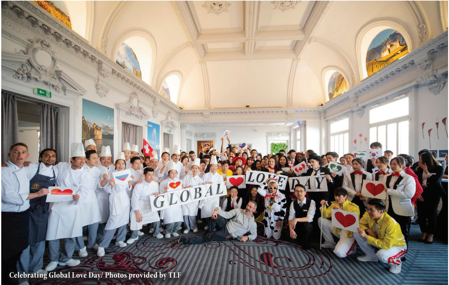
Celebrating Global Love Day